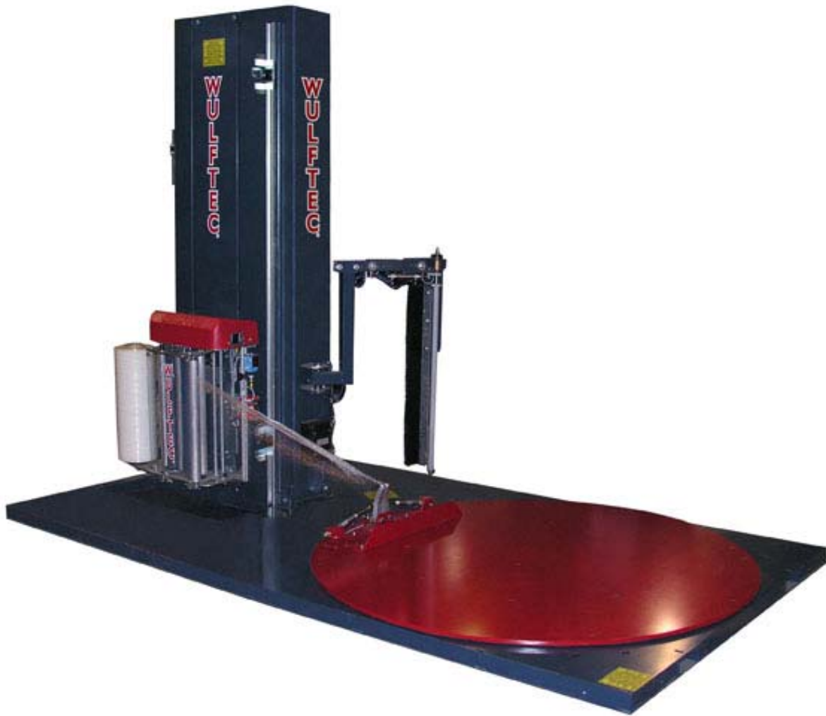
MODEL SMLPA-200 – 65” DIAMETER 5,000 LB. CAPACITY AUTOMATED LOW PROFILE SMART SERIES STRETCH WRAPPER (WITH NO-THREAD® POWERED PRE-STRETCH CARRIAGE)